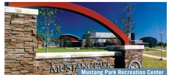
Mustang Park Recreation Center

Reservations for Nimitz, Irving and MacArthur high school tennis courts may be made for Irving residents by calling (972) 721-2656 weekdays between 10 a.m. and 3 p.m. Each reservation is for 90 minutes. Reservations must be made within the same one week period. Tennis courts located at Cimarron, Nichols, Northwest, Mustang, Senter and Sunrise parks are available on a first-come, first-served basis unless the recreation centers have tennis classes in session. Tennis classes are offered at Cimarron, Mustang, Senter and Northwest park recreation centers.