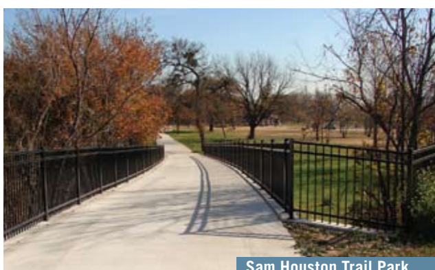
Sam Houston Trail Park