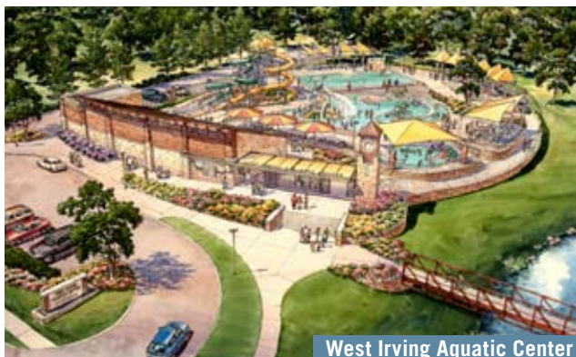
West Irving Aquatic Center