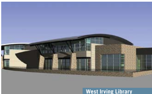
West Irving Library