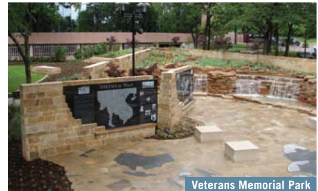
Veterans Memorial Park