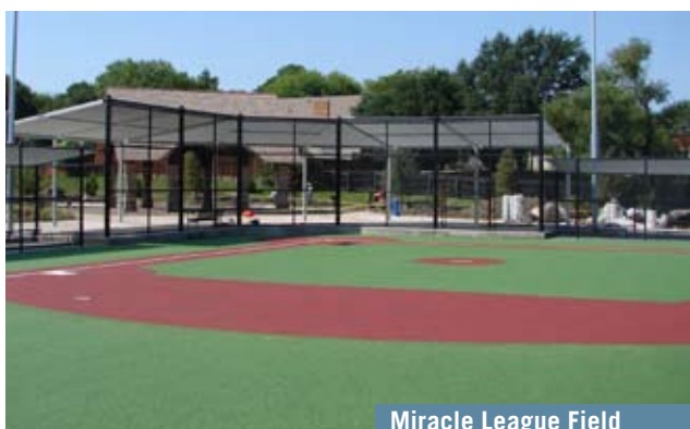
Miracle League Field