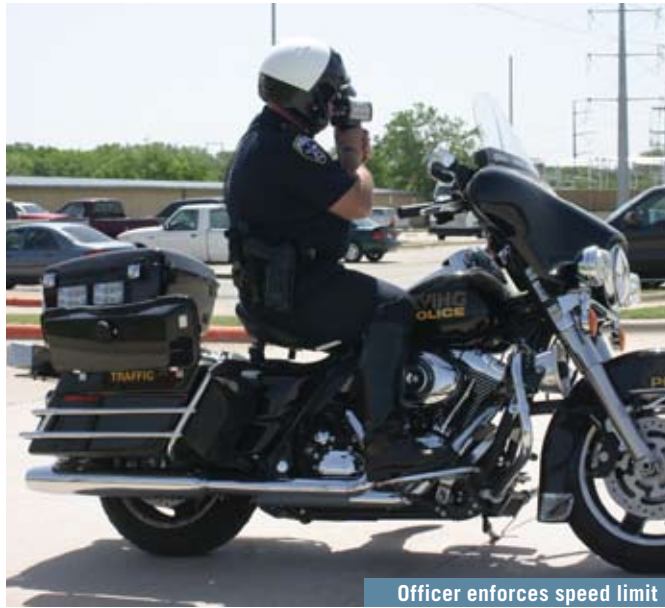
Officer enforces speed limit