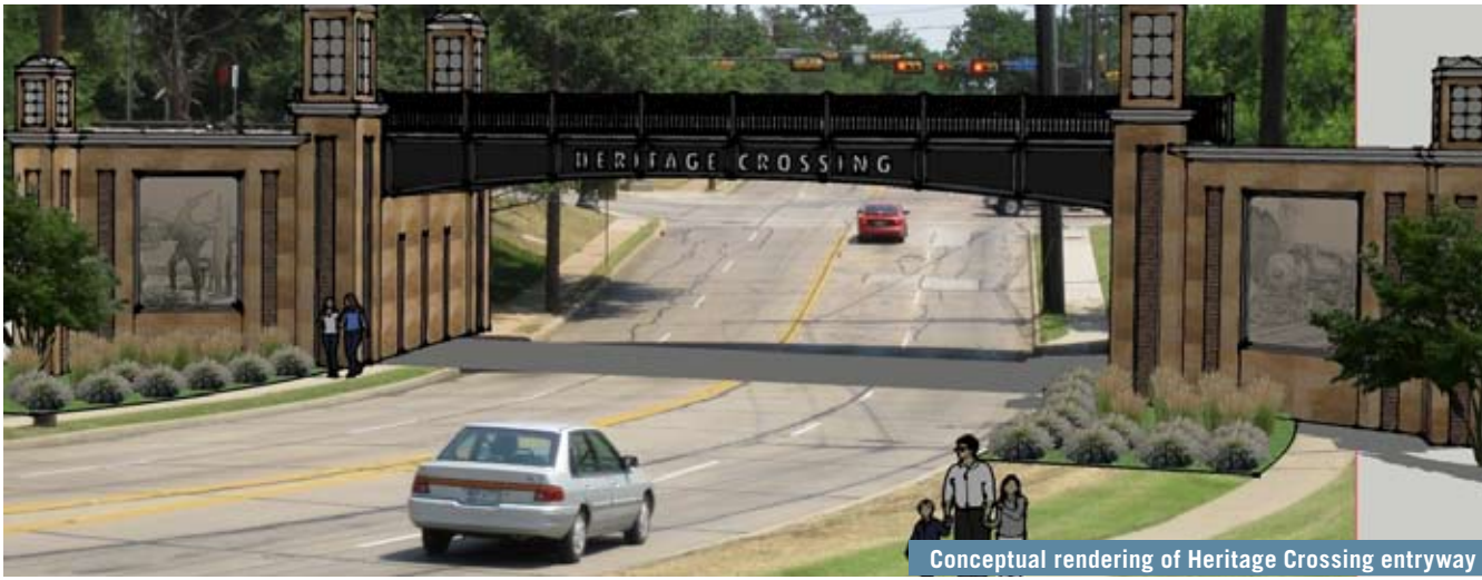
Conceptual rendering of Heritage Crossing entryway