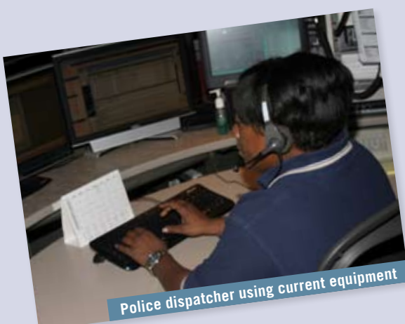
Police dispatcher using current equipment

Replacement is funded through the use of voter-approved bond funds. The new system will allow emergency responders and other field personnel to not only communicate with each other during a widespread emergency, but with responders from other cities. ■