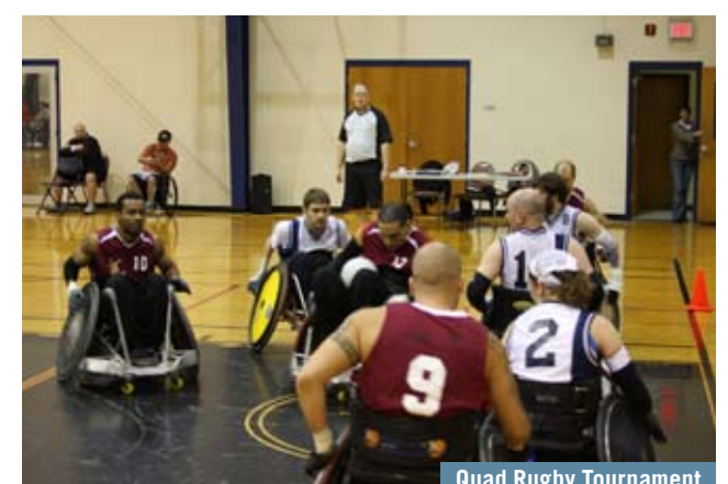
Quad Rugby Tournament