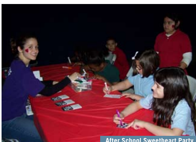
After School Sweetheart Party