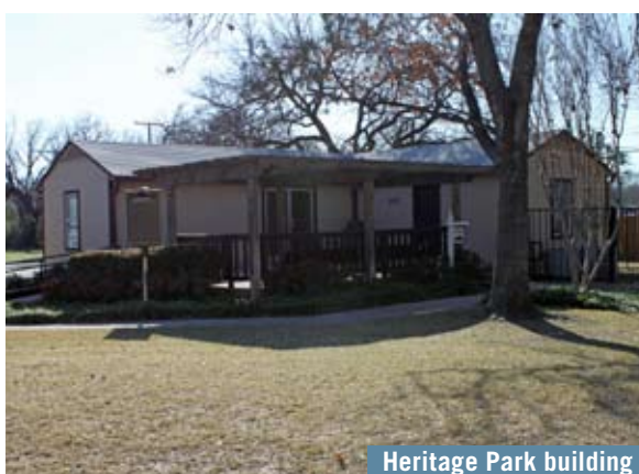
Heritage Park building

Reservations for Nimitz, Irving and MacArthur high school tennis courts may be made for Irving residents by calling (972) 721-2656 between 10 a.m. and 3 p.m. weekdays. Each reservation is for 90 minutes. Reservations must be made within the same one-week period. Tennis courts located at Cimarron, Nichols, Northwest, Mustang, Senter and Sunrise parks are available on a first-come, first-served basis unless the recreation centers have tennis classes in session. Tennis classes are offered at Cimarron, Mustang, Senter and Northwest park recreation centers. ■