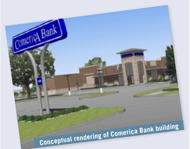
Conceptual rendering of Comerica Bank building