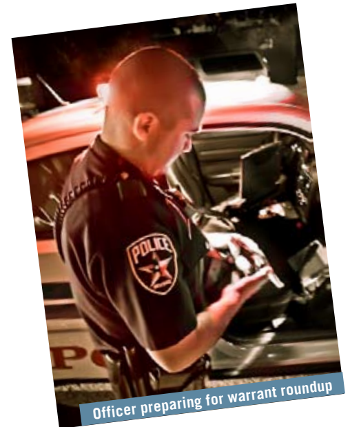
Officer preparing for warrant roundup

Those with outstanding warrants are urged to contact the Irving Municipal Court at (972) 721-2671, or visit the Irving Municipal Court, located at 305 N. O'Connor Road, from 8 a.m. to 5 p.m. Monday through Friday. ■