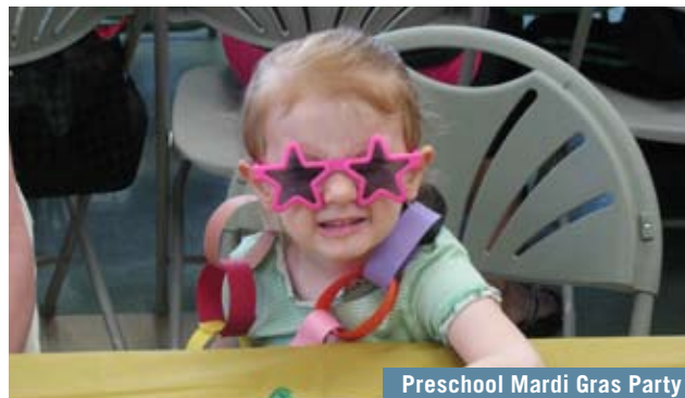
Preschool Mardi Gras Party