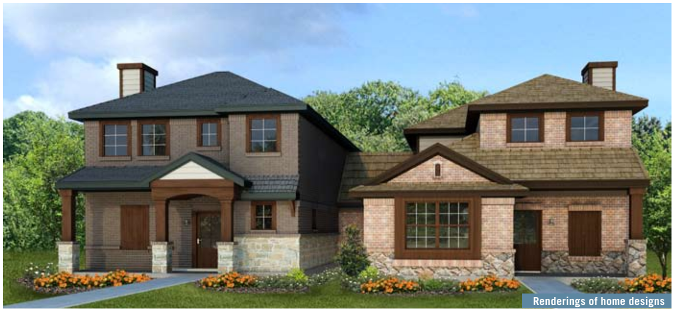
Renderings of home designs

El período de 30 días para inscribirse es del 4 de febrero al 5 de marzo. La Votación Adelantada es del 30 de abril al 8 de mayo. Una lista de lugares de votación será proporcionada en la página web de la ciudad debajo de la pestaña "Council." Para mayor información, llame a la Oficina de la Secretaría de la Ciudad al (972) 721-2493. ■