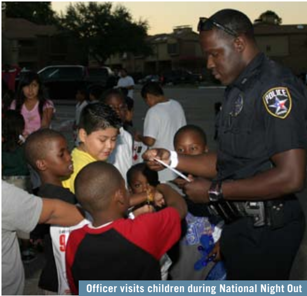
Officer visits children during National Night Out